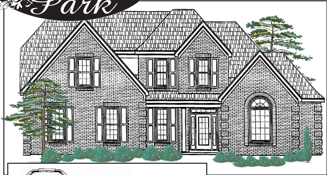
Sizes are approximate. Artwork may vary from actual construction.

Approximately 2431 heated sq. ft. (Expandable to 2890 sq. ft.)